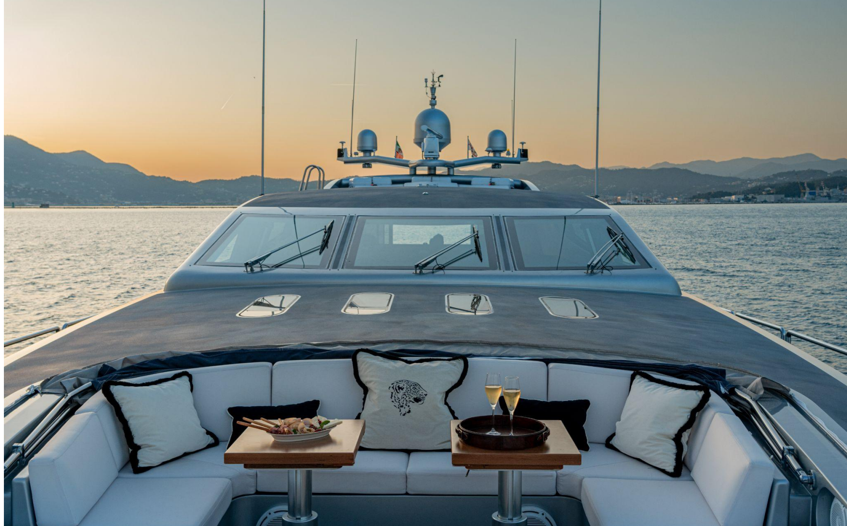
Exterior forward area